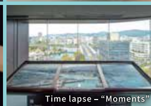
Time lapse - "Moments"

Enjoy historical exhibitions and interactive digital contents on this climate-controlled floor. Also experience "ORIZURU WALL", the enduring symbol of this tower. Fold a paper crane with our original ORIGAMI paper, and toss it into the 50m glass wall. The "ORIZURU WALL" will be completed by visitors' cranes and good wishes filling up the space.