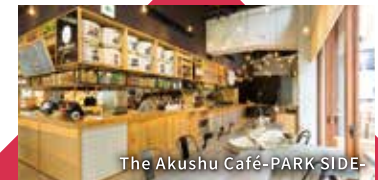
The Akushu Café - PARK SIDE-