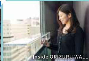
Inside ORIZURU WALL