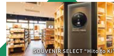
SOUVENIR SELECT "Hito to Ki"

At SOUVENIR SELECT "Hito to Ki", about 1,000 of Hiroshima's local specialties selected by our staffs are available. Enjoy time selecting items for yourself or for someone special.